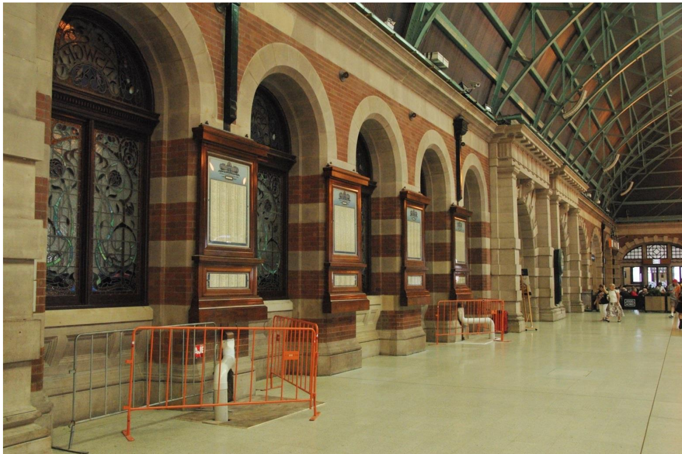
NSW Government Railways & Tramways Roll of Honour