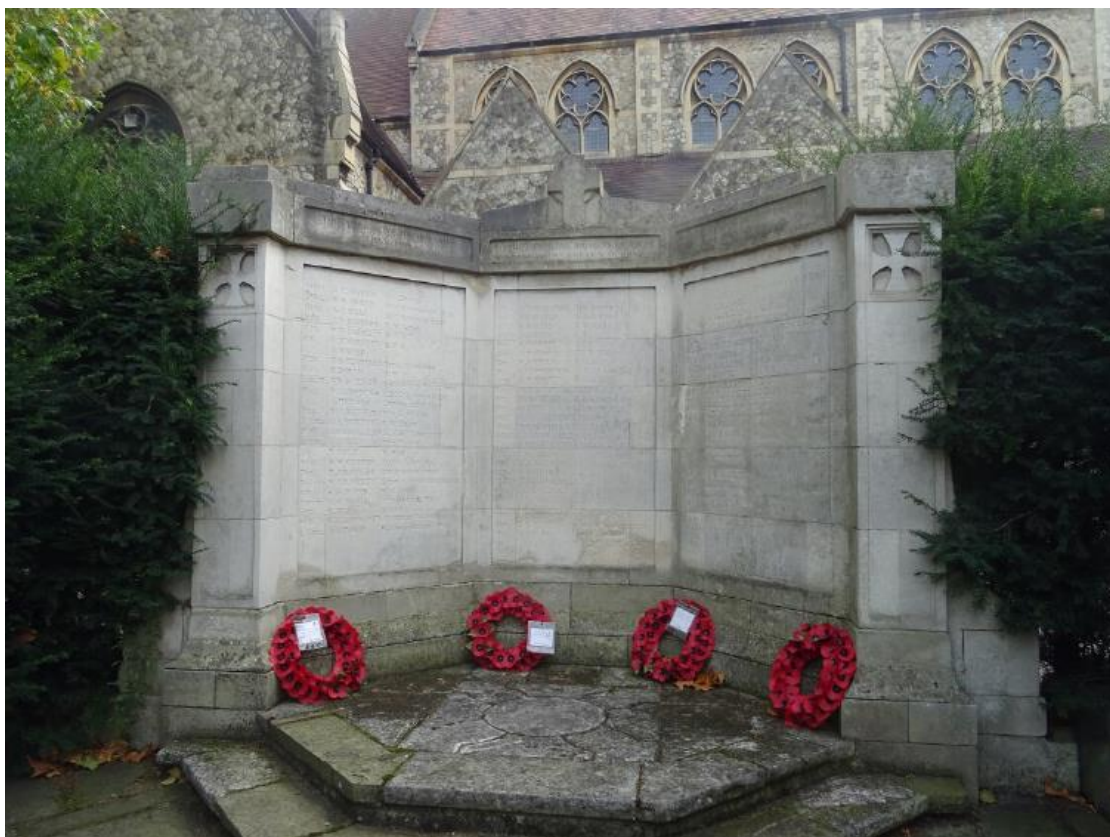
St. Mildred's Church War Memorial, Lee