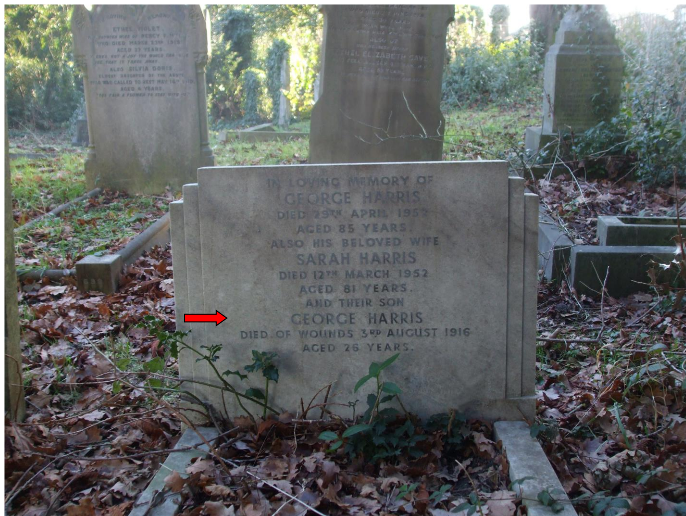
Photo of Private George Harris' shared Private Family Headstone in Hither Green Cemetery, London, England.